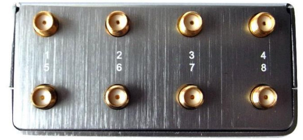
The number indicators are corresponding to the number of antennas.